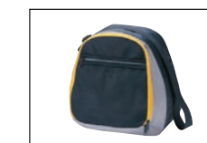
Top Case Inner Bag