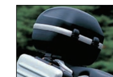
31-Liter Top Case