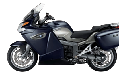
Royal Blue Metallic