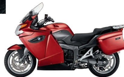
Red Apple Metallic