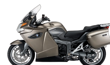
Magnesium Beige Metallic