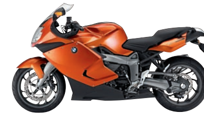
Lava Orange Metallic