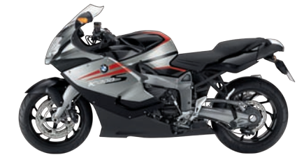
Sapphire Black / Granite Grey / Magma Red