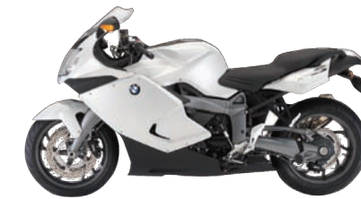
Light Grey Metallic