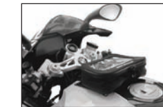
HP2 Sport Tank Bag